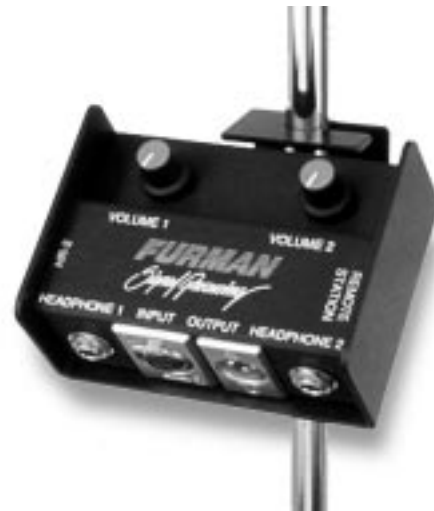
HR-2 Headphone Remote Box

The unit shall be the Furman SP-20A Stereo Power Amplifier.